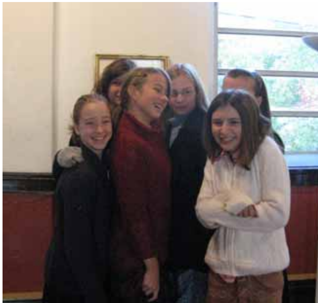
Lyceum girls pretending to be chilly!

For these and other contemporary scientists, evolution and genetic determinism are central to the explanation of the human person. Biology today is dominated by Darwin's theory of evolution. Indeed Darwinism , as a belief system, is a dominant factor in biology. In this view the universe is the result of a chance event. The initial conditions of the universe provide a beginning to evolutionary processes, which lead also by chance, to humans. There is no purpose or design in such a chance universe, and therefore human beings have no meaning or purpose either. It is a seemingly depressing view of our world. If life and the world are pointless, why not just adopt a