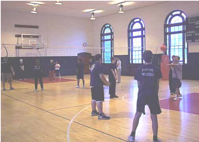
Mens sana in corpore sano!