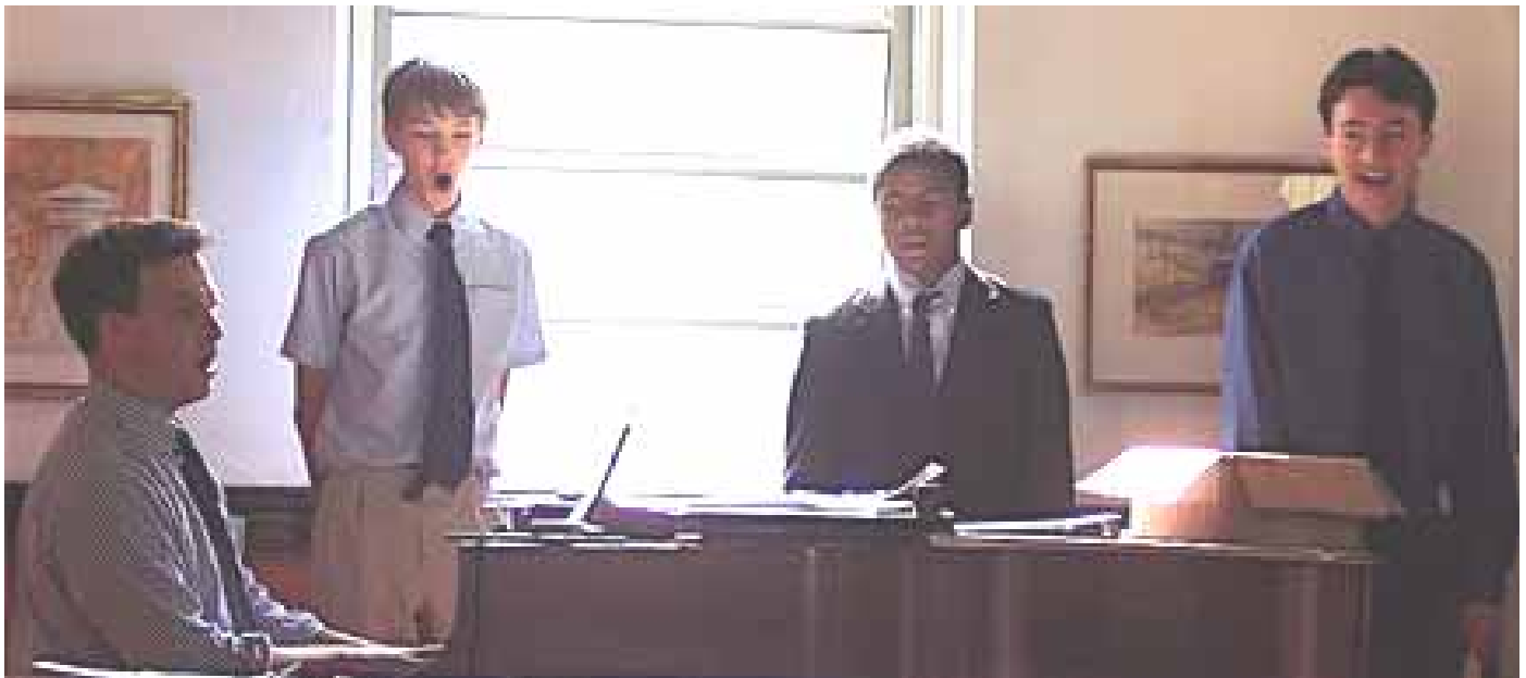
Men carrying on the traditions of Western Civilization – singing!

many people who will challenge both your Catholic faith and the excellent academic standards you have encountered at the Lyceum. There will be challenges both to