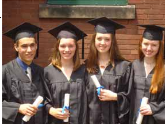
The Class of 2008