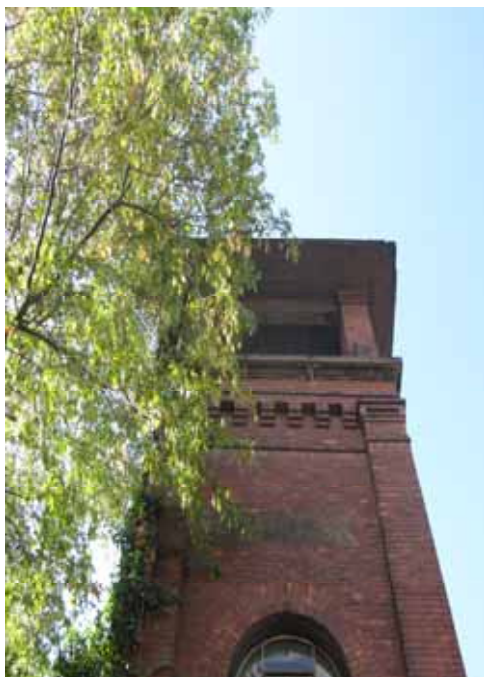
The Lyceum Bell Tower

THE LYCEUM 2062 MURRAY HILL ROAD CLEVELAND, OH 44106 Phone 216.707.1121 Web: thelyceum.org